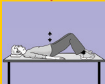
Bridge or Scoot Up Bed

Actions may be performed with or without equipment, as required.